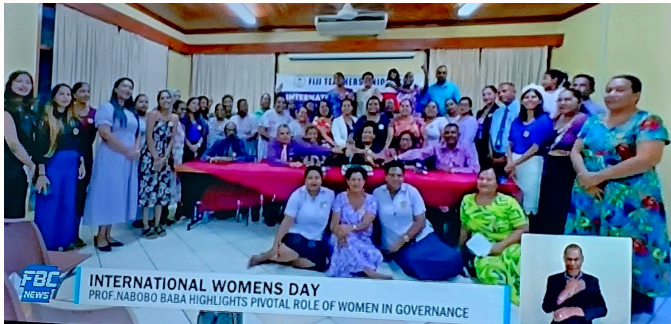
Members gathered at FTU HQ to celebrate International Women's Day