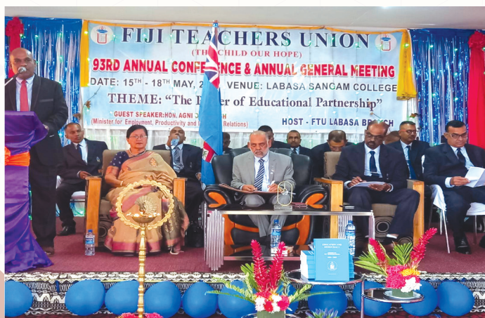
Flashback- the FTU AGM and Annual Conference at Labasa Sangam College