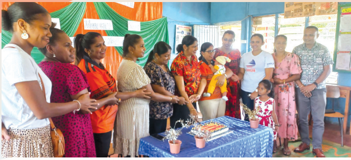
Bua Women's Wing celebrating IWD